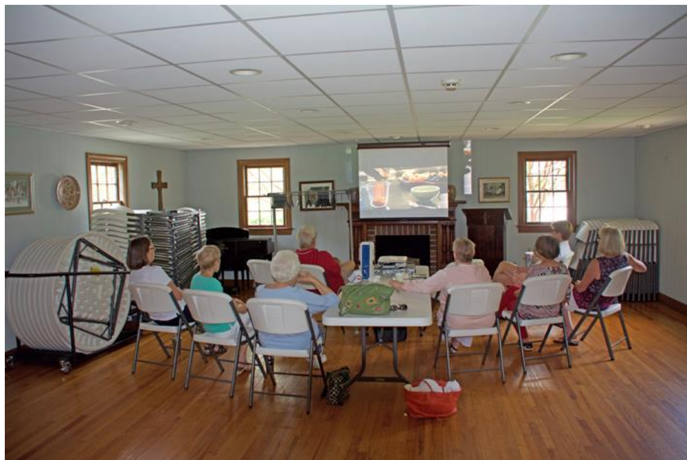
Watching The Devil Wears Prada